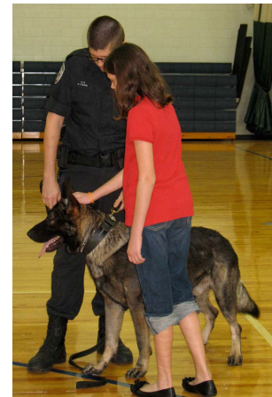
Meeting K-9 Officer Argos