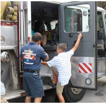
First stop was Gainesville Fire Rescue Station 3. Personnel showed the children the station and the inside of the trucks.